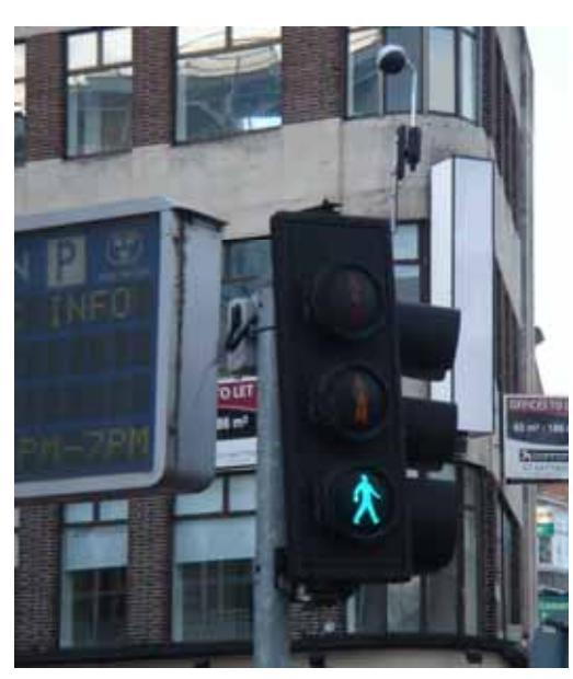
At zebra crossings, C-Walk can increase safety and efficiency for both pedestrians and motorists.

C-Walk is based on field-proven video detection technology and is part of the Traficon product range. Traficon is worldwide recognized as the market leader in traffic video detection.